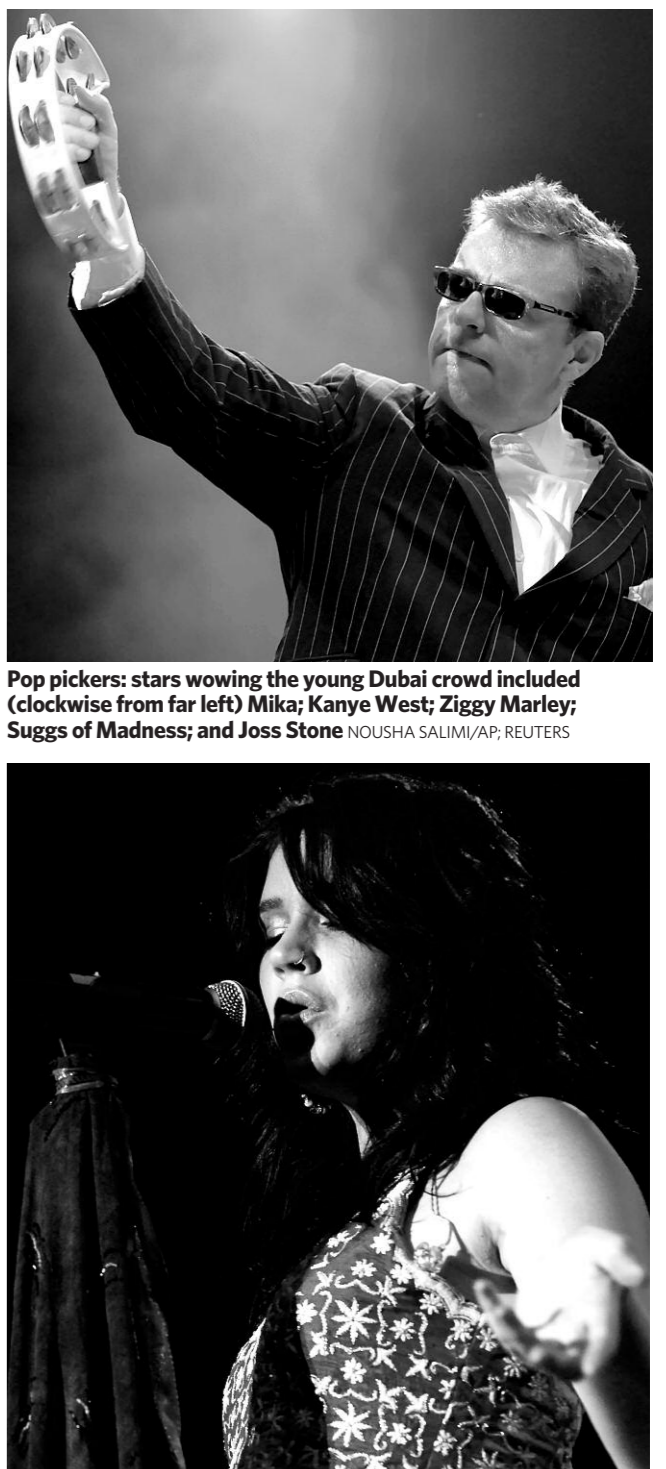
Pop pickers: stars wowing the young Dubai crowd included (clockwise from far left) Mika; Kanye West; Ziggy Marley; Suggs of Madness; and Joss Stone

apparent string or horn component. The harpist was a particularly forlorn figure, only occasionally called upon to pluck a few chords, but perched high and looking impossibly alluring: she was so Dubai.